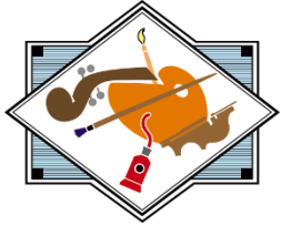
Arts & Communications