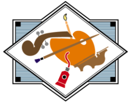
Arts & Communications