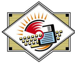
Business, Management Marketing & Technology