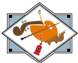
Arts & Communications