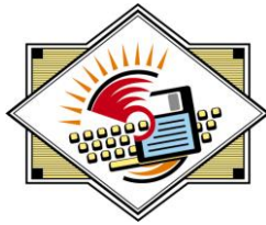
Business, Management Marketing & Technology