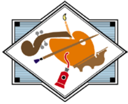
Arts & Communications