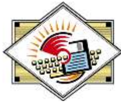
Business, Management Marketing & Technology