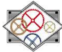
Engineering/Manufacturing & Industrial Technology