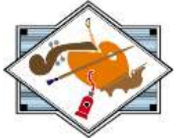
Arts & Communications